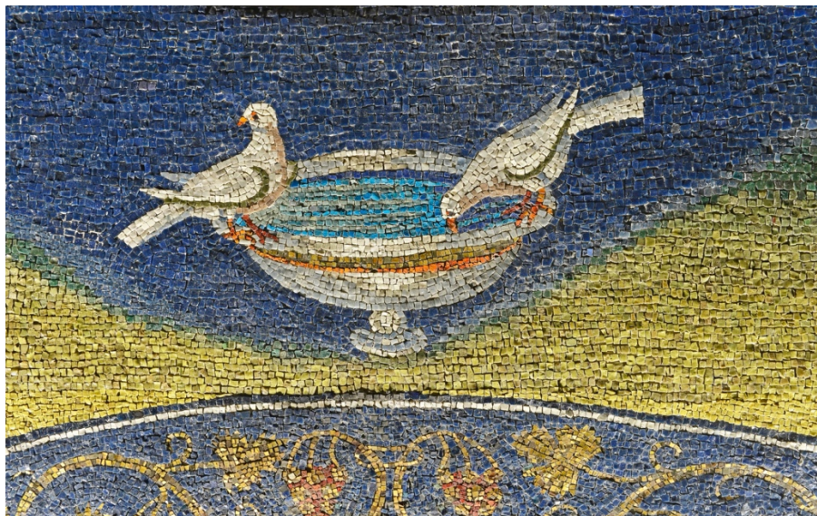
Il Mausoleo di Galla Placidia di Ravenna, "Colombe abbeveranti", V secolo.